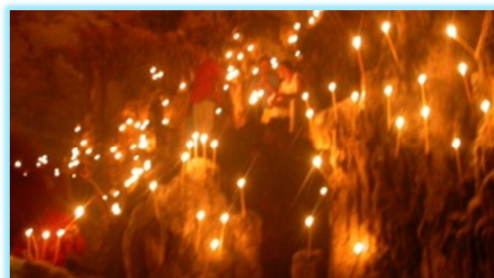
Annual service in Aghios Gioannis cave